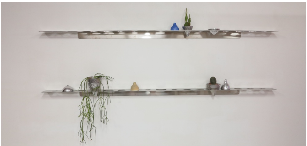
Shelves L #200, hairline stainless steel, 200 x 12 x 6cm, designed by Philippe Stouvenot in collaboration with the artist for Breast Stupa Cookery Market Tokyo 2013