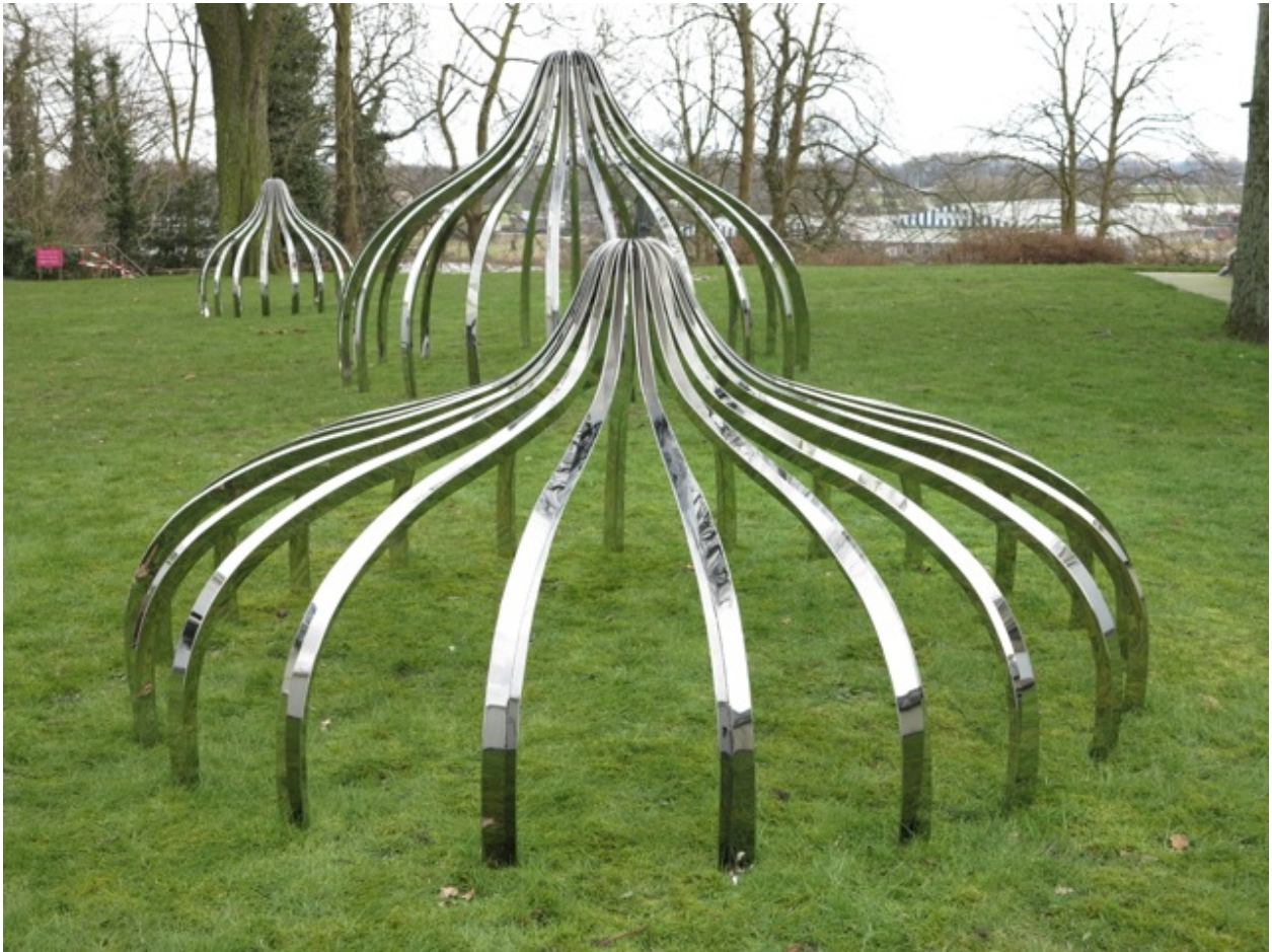
Installation view of Breast Stupa Topiary at Museum voor Moderne Kunst Arnhem, The Netherlands, 2013, stainless steel, dimensions variable

For inquiries, please contact Irene Fung at irene@yavuzfineart.com or at 65 (6338) 7900.