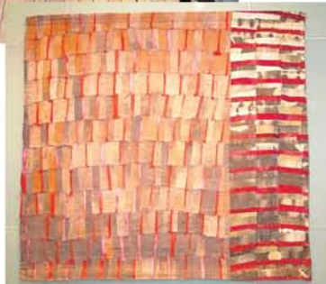
RIGHT One of the artist's early abstract works.